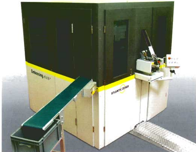
Embossing 8000 rotary table with sound insulation enclosure

New Technology provides unrivalled production throughputs